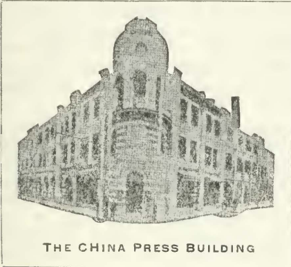
THE CHINA PRESS BUILDING

An American Newspaper devoted to cementing the friendly relationships—political, commercial and social—between the Republic of the United States and the Republic of China.